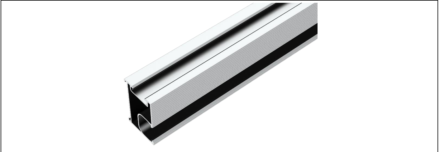
DC Rail 50 Part No.: ER-R-DC50/XXXX